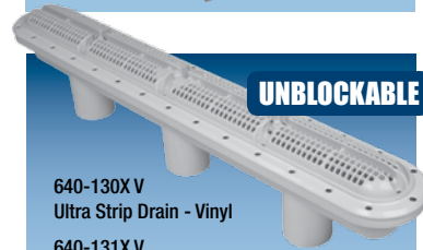
640-130X V Ultra Strip Drain - Vinyl 640-131X V Ultra Strip Drain - Fiberglass 640-132X V Ultra Strip Drain - Concrete 640-133X V Ultra Strip Drain - Field Built