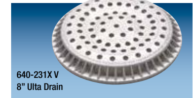
640-231X V 8" Ultra Drain