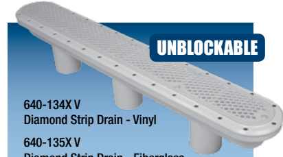
640-134X V Diamond Strip Drain - Vinyl 640-135X V Diamond Strip Drain - Fiberglass 640-136X V Diamond Strip Drain - Concrete 640-137X V Diamond Strip Drain - Field Built