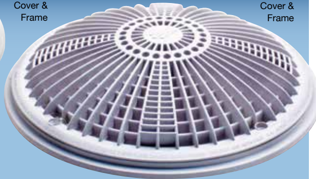
10" Tru Flo Drain