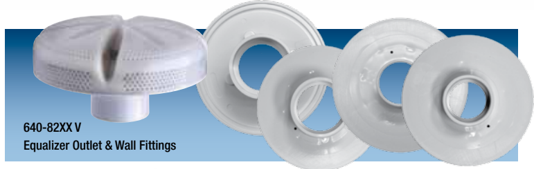
640-82XX V Equalizer Outlet & Wall Fittings